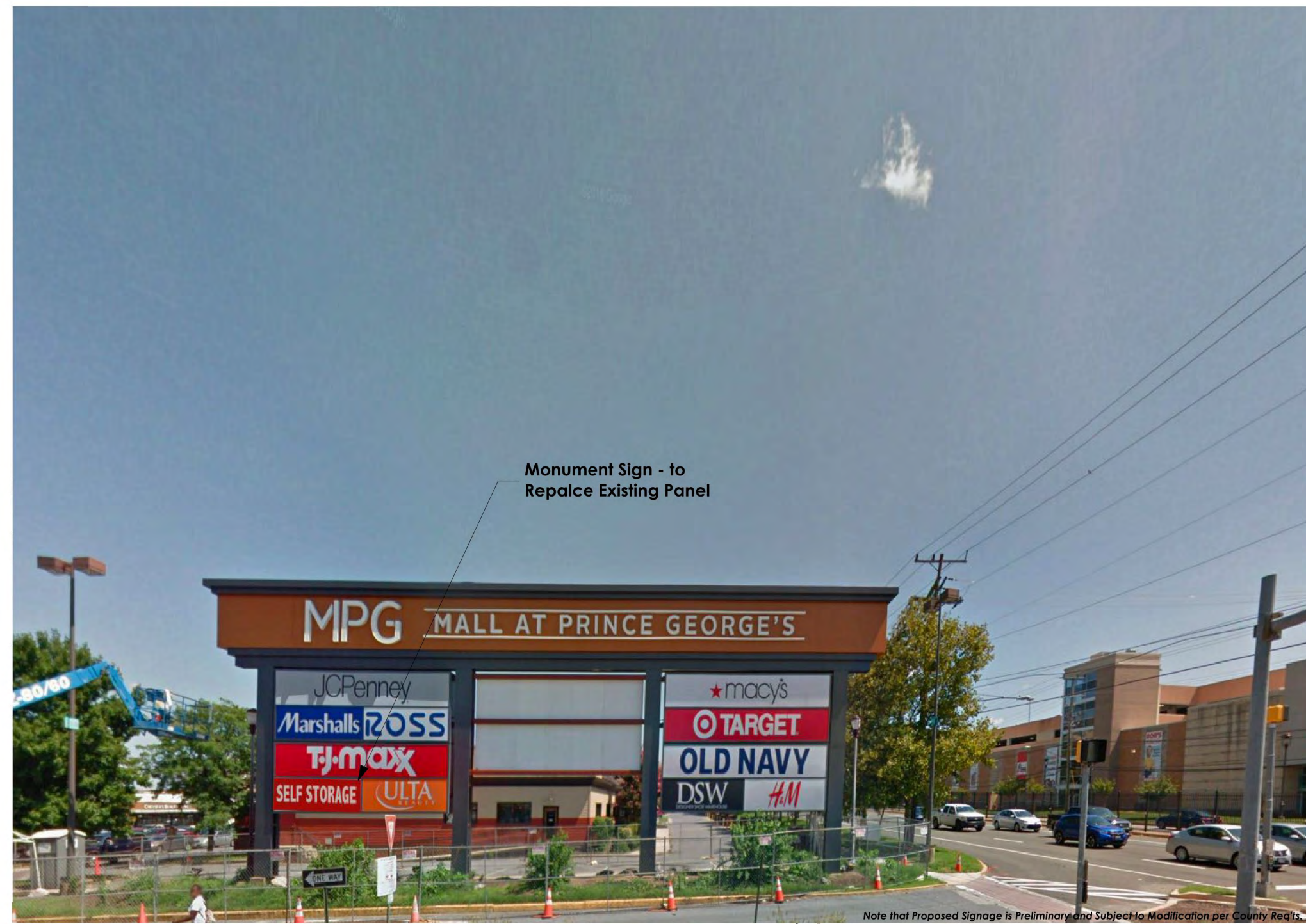
1 - Front Entrance at East West Highway

PSG Storage Signage Study - Rev. 02 BWD Project # 20-063 - Sheet 01 of 03