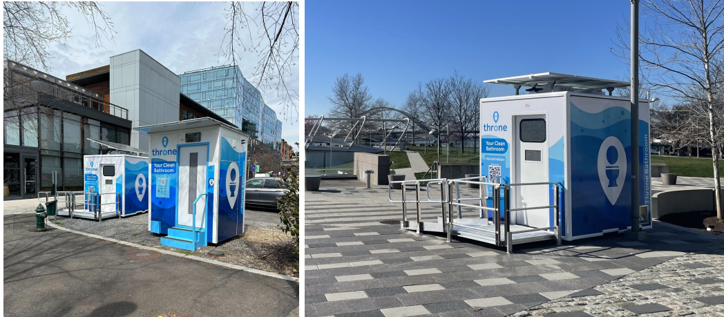
Figure 1: Throne ADA and Step-up units in Yards Park (Washington, DC)

Thrones come in two models: Step-up and ADA. Unlike typical portable restrooms and trailers, the ADA model exceeds Federal ADA standards for an accessible restroom. For public use to meet accessibility regulations, the Step-up Throne must be placed as a second unit along with an ADA unit.