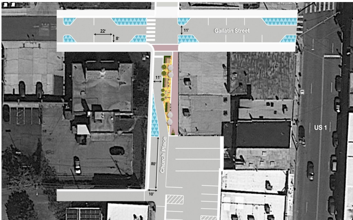
Exhibit B: Proposed Redesign