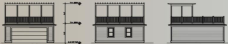
5 ELEVATIONS - ONE STORY PLUS ROOFTOP DECK A2.7 1/8" = 1'-0"