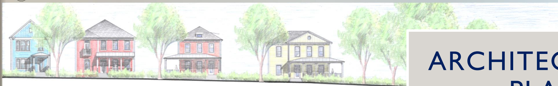
2 STREET ELEVATION - HAMILTON ST - PROPOSED SOUTH, WEST HALF 3/32" = 1'-0"