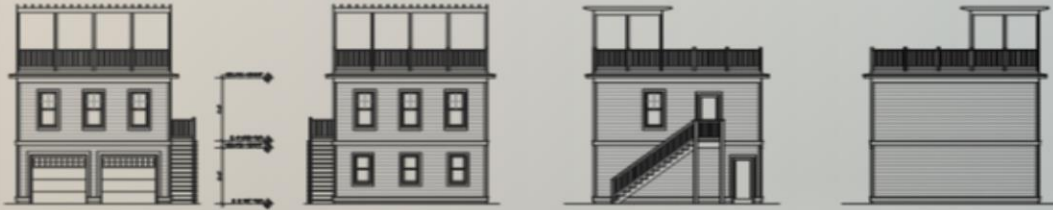
3 ELEVATIONS - TWO STORY PLUS ROOFTOP DECK A2.7 1/8" = 1'-0"