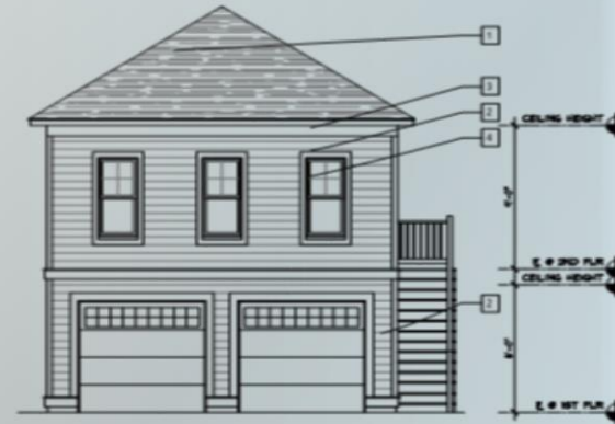
2 FRONT ELEVATION (2 STORY) A2.7 1/8" = 1'-0"