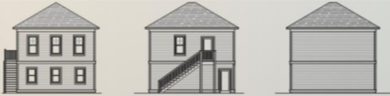
2 ELEVATIONS - TWO STORY A2.7 1/8" = 1'-0"