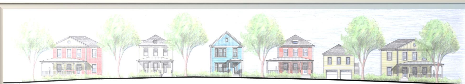
1 STREET ELEVATION - 41ST AVE. - PROPOSED WEST 3/32" = 1'-0"