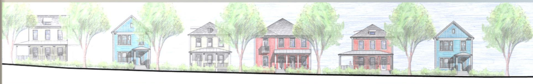
1 STREET ELEVATION - HAMILTON STREET - PROPOSED SOUTH, EAST HALF 3/32" = 1'-0"