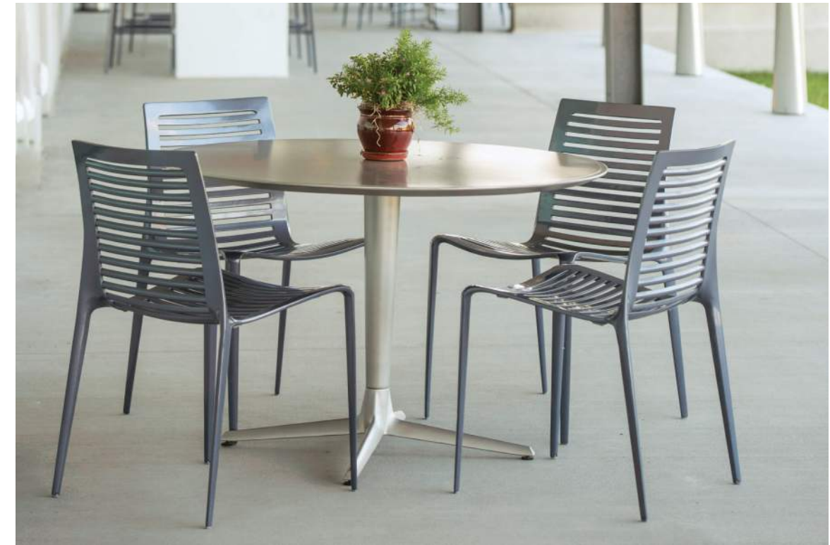
TABLES & CHAIRS