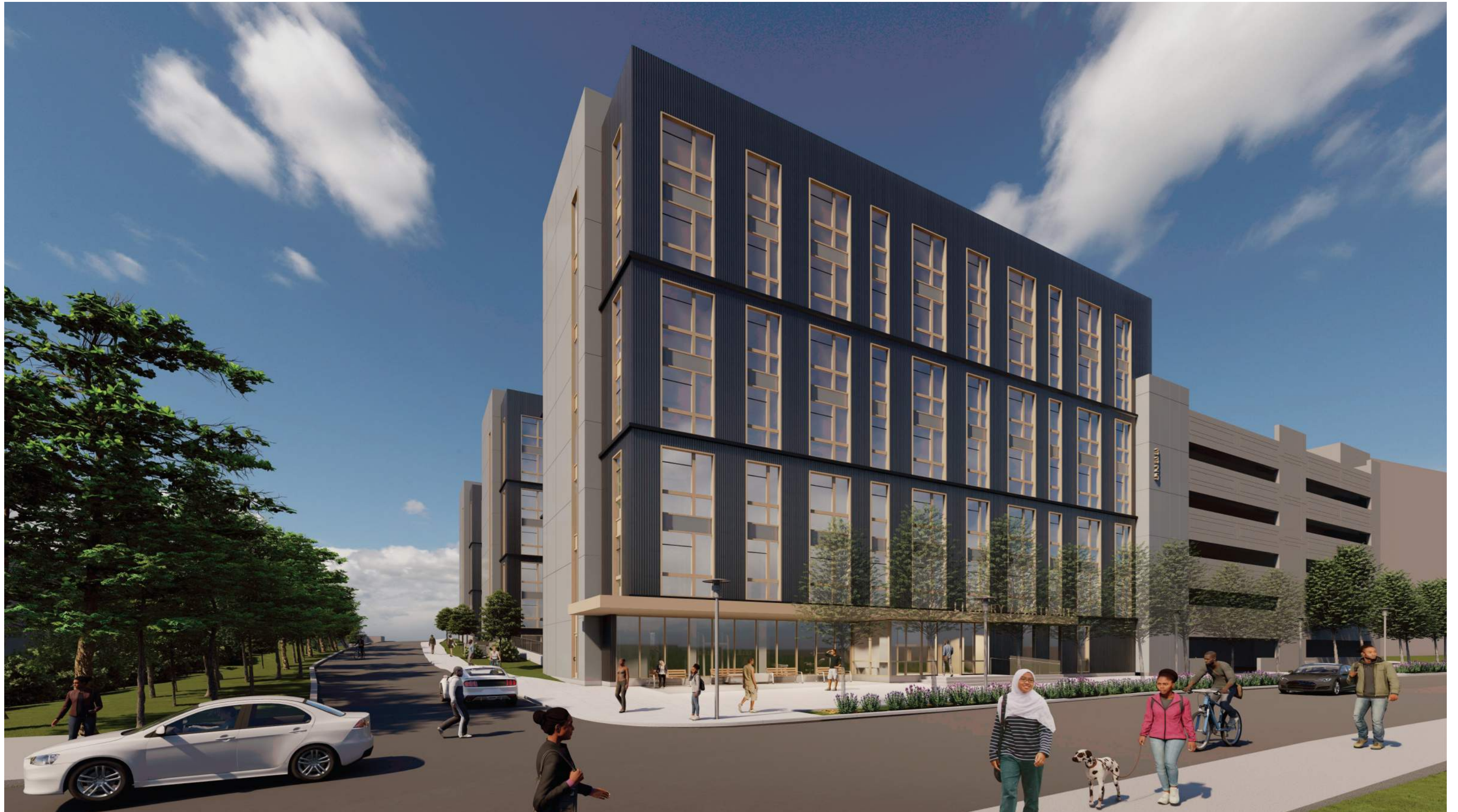
VIEW FROM NORTHEAST CORNER