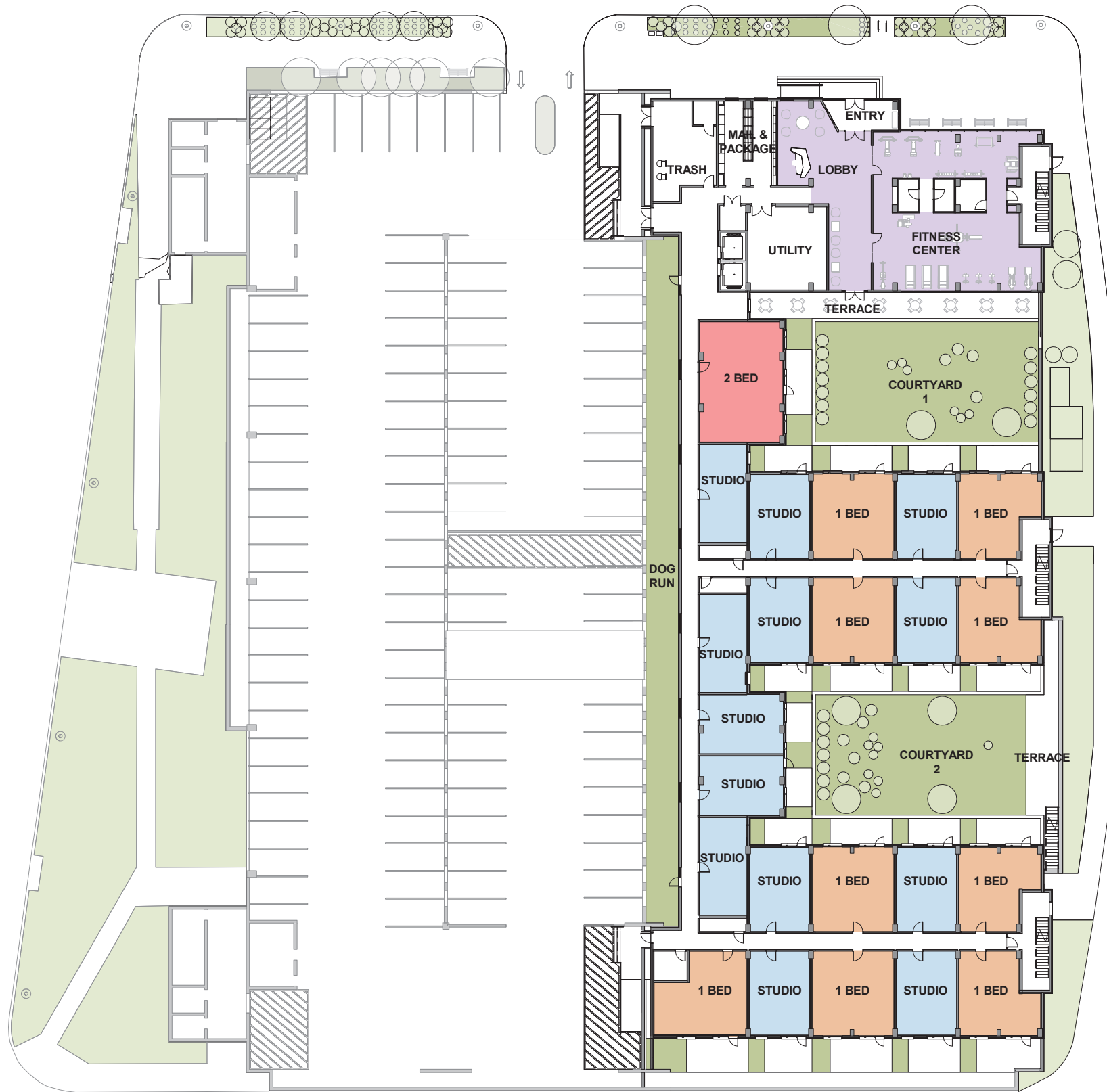
LEVEL 1 FLOOR PLAN