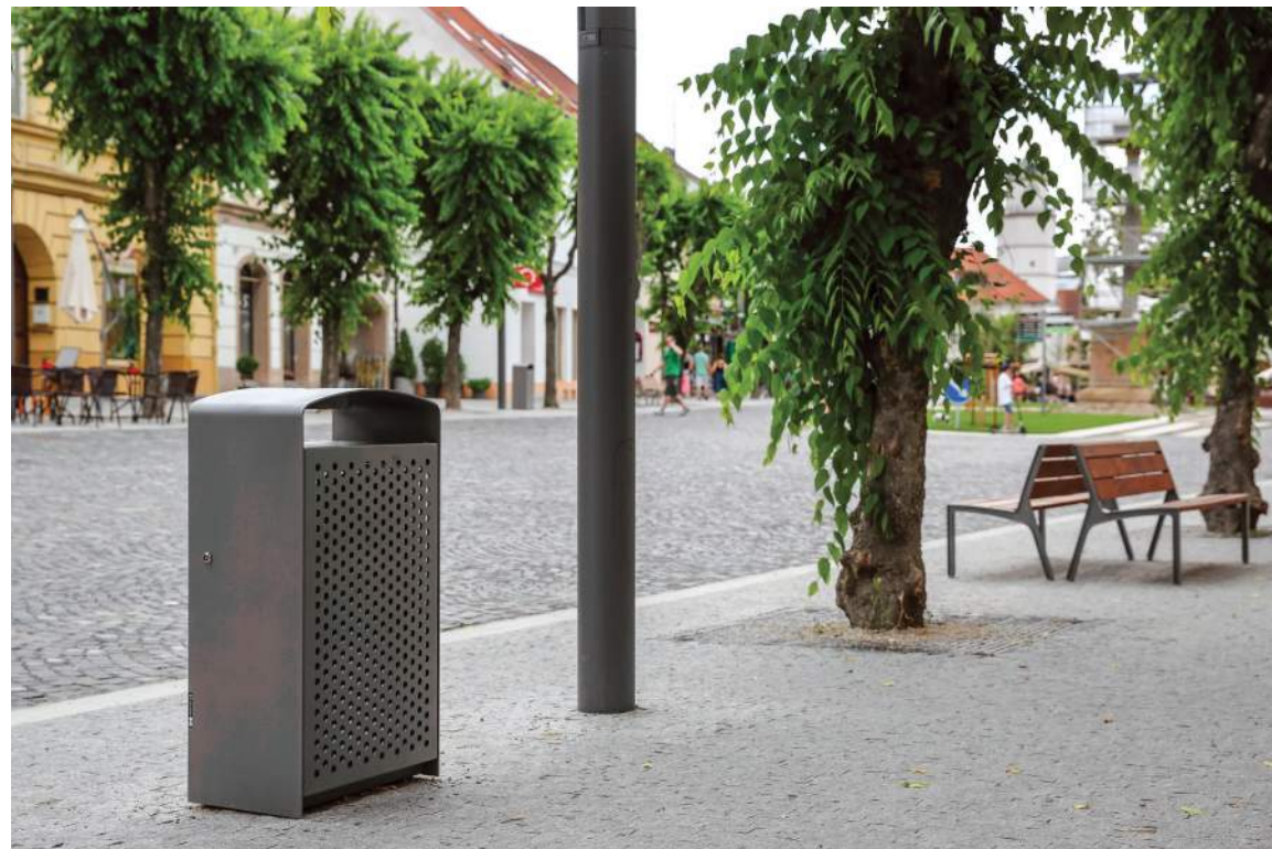
TRASH & RECYCLING BINS