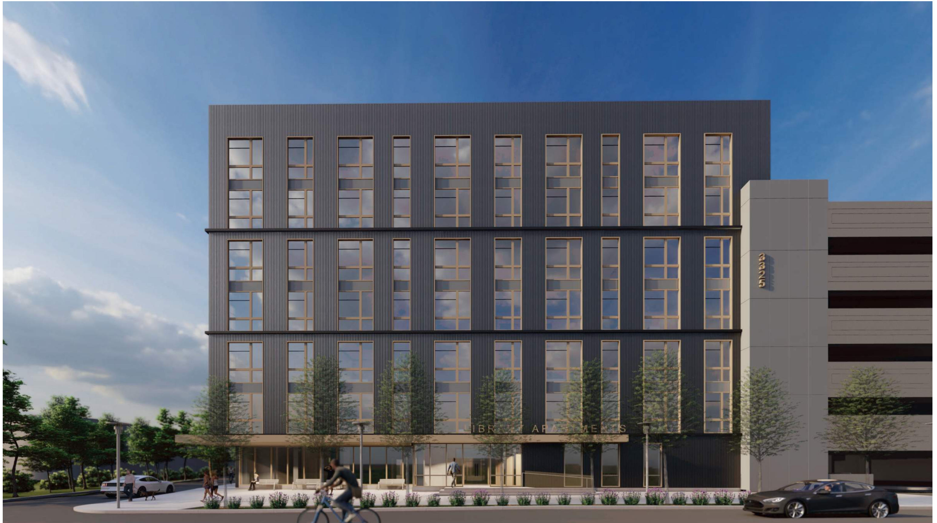
NORTH ELEVATION @ TOLEDO ROAD