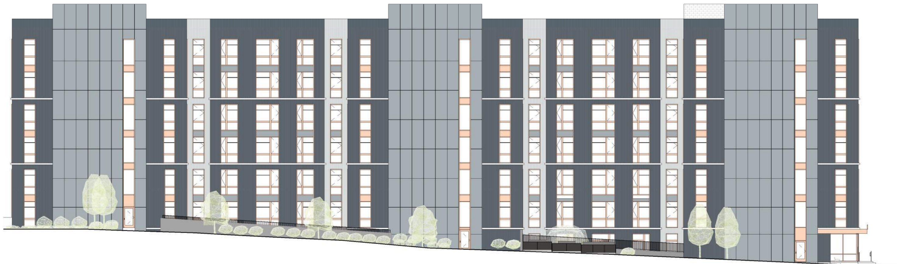
EAST ELEVATION @ DEMOCRACY AVENUE