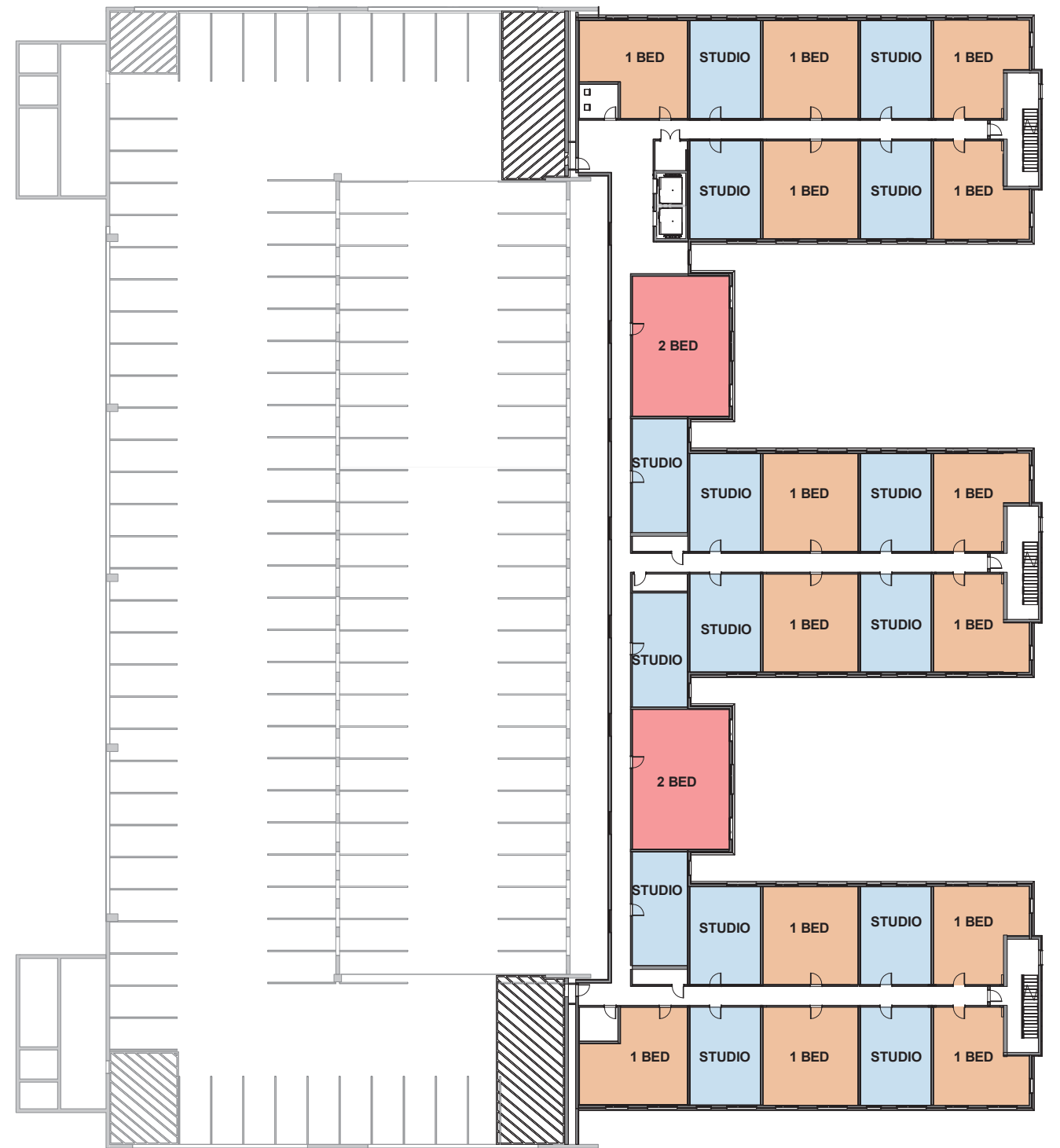
TYPICAL LEVEL (2-7) FLOOR PLAN