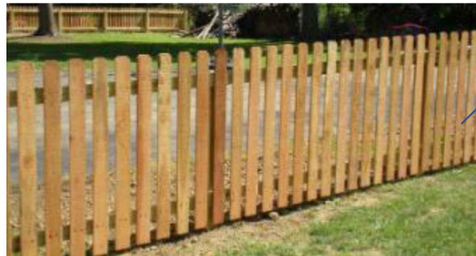
Figure 5: Detail example of proposed fence

Height: 4 feet Material: pressure treated wood slats with 3" gaps between