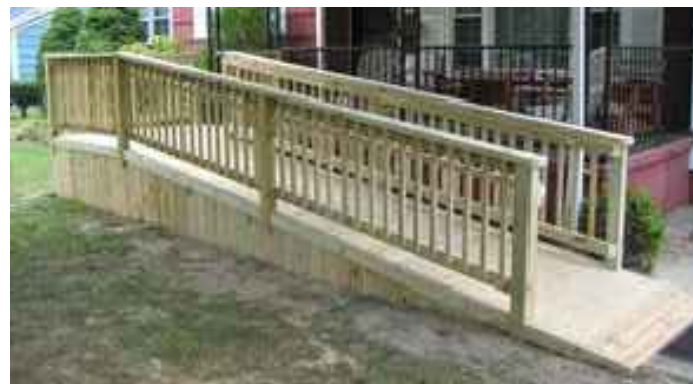
Figure 4: Detail example of proposed ADA ramp

Slope: Max 1:12 Material: pressure treated wood with 32" tall railings