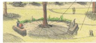
Gathering circle, view to the north