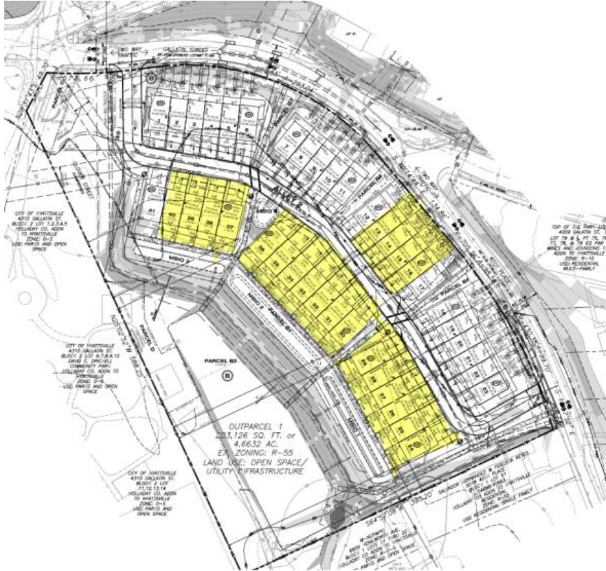
Exhibit E: Lots Requiring DDOZ Variance

The applicant is requesting a modification to this standard to allow greater than 20 percent impervious surface in the front yards of lots 13-16 and 25-40. The lots requiring modification to the design standard are shown in yellow in Exhibit E below. These lots exceed the 20 percent impervious area maximum at 22.73 percent. Staff recommends supporting this variance, as the percentage is within 5% of requirements and is consistent with variances supported by the City for previous applications. Exterior decks provide a sense of place, eyes on the street and is consistent with housing characteristics of existing homes within the Historic District.