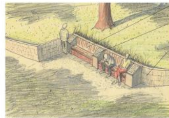
Detail of benches and plinths