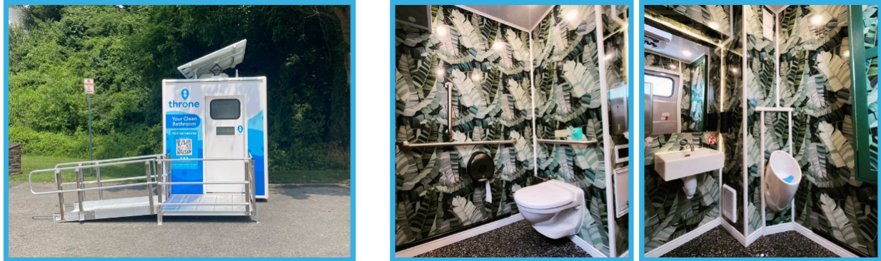
Figure 1: Throne Bathroom Exterior and Interior Views

and do not require any connection to water or sewer. The portable nature of Throne units eliminates capital costs, makes it fast and easy to deploy bathrooms, and allows customers to test different locations to optimize the network for maximum value to their residents, riders and visitors.