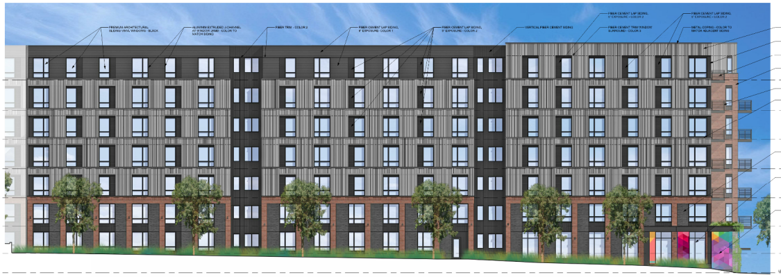
2 SOUTH ELEVATION - EAST-WEST HIGHWAY