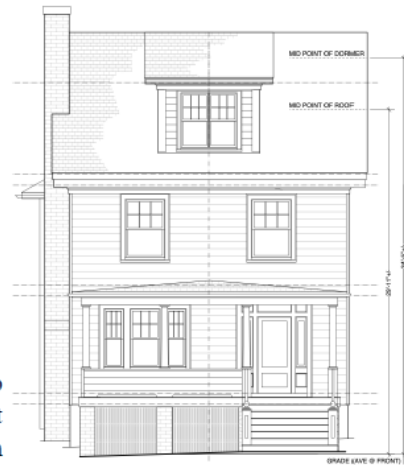
Figure 2b Proposed Front Elevation

The proposed third-floor addition aligns with the character of the surrounding area and does not create significant overshadowing or privacy concerns. The existing 6ft fence effectively screens the accessory structure, mitigating visual impacts on adjacent properties and the streetscape. While the accessory structure is in the required front yard, the intent of the setback requirement is to maintain aesthetic and functional consistency. The fence provides sufficient screening, preserving neighborhood character. Furthermore, the 3 rd floor addition is designed in a way that respects historical architectural features and is harmonious with the existing architectural characteristics of the neighborhood.