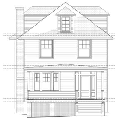
Figure 2a Existing Front Elevation