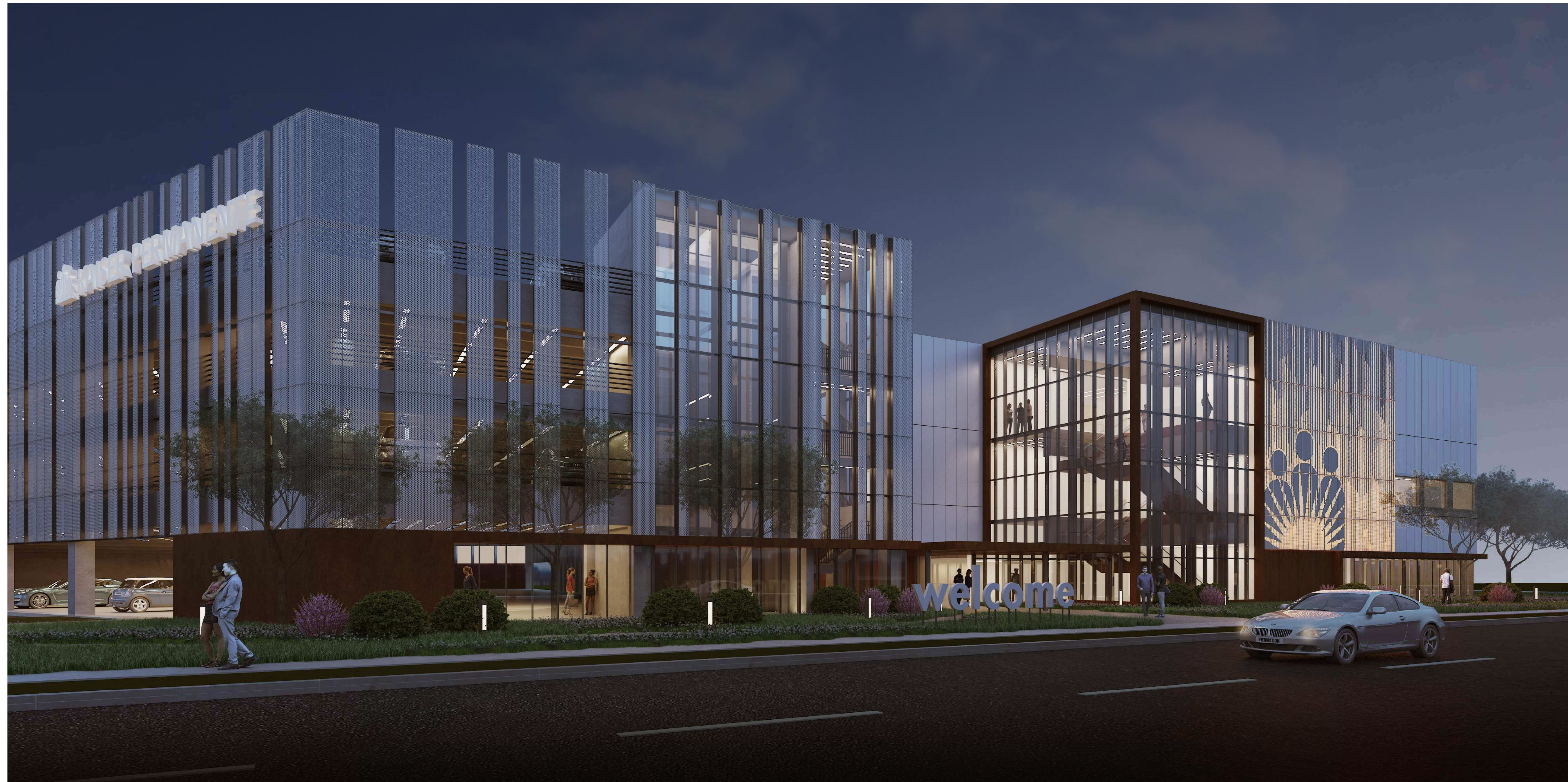
AGER ROAD VIEW