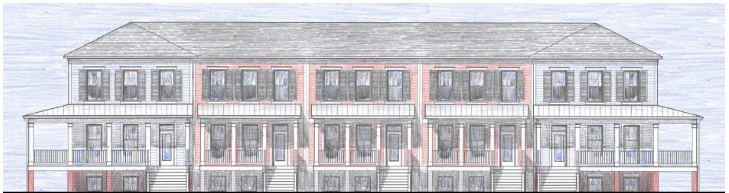
Exhibit A: Townhouse Units (group front elevation)